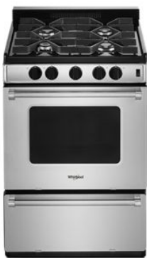
SUITE MATCH COOKING RANGE / WALL OVEN WFG500M4H

Be sure to tune into your customers' shopping priorities to bundle products across categories