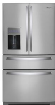
ALSO AVAILABLE / STEP UP WRMF7736P

Be sure to tune into your customers' shopping priorities to bundle products across categories