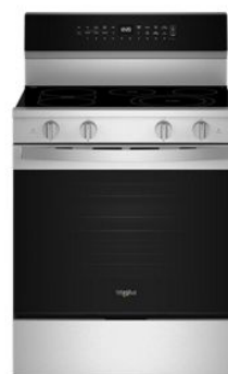
SUITE MATCH COOKING COOKTOP / MICROWAVE / VENTILATION WFES7530R