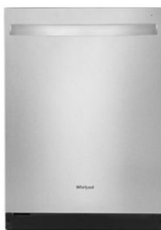
SUITE MATCH DISHWASHER WDT730HAM