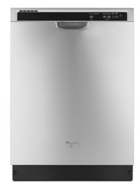
SUITE MATCH DISHWASHER WDF520PAD