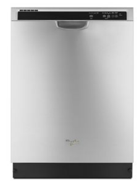
SUITE MATCH DISHWASHER WDF520PAD