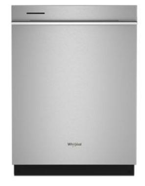
SUITE MATCH DISHWASHER WDTS7024R