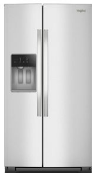
ALSO AVAILABLE / STEP UP WRSC5536R

Be sure to tune into your customers' shopping priorities to bundle products across categories