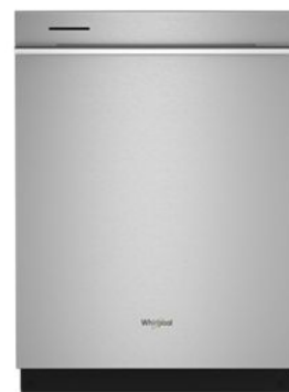
SUITE MATCH DISHWASHER WDTS7024R