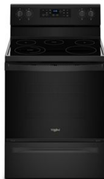
SUITE MATCH COOKING RANGE / WALL OVEN WFE505W0H