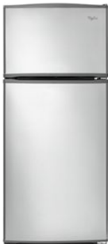
ALSO AVAILABLE / STEP UP WRT316SFD

Be sure to tune into your customers' shopping priorities to bundle products across categories