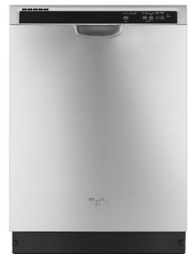
SUITE MATCH DISHWASHER WDF520PAD