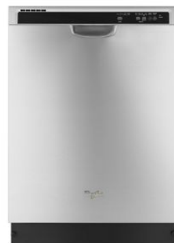
SUITE MATCH DISHWASHER WDF520PAD