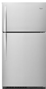
ALSO AVAILABLE / STEP UP WRT541SZD

Be sure to tune into your customers' shopping priorities to bundle products across categories