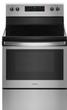
SUITE MATCH COOKING RANGE / WALL OVEN WFE505W0H