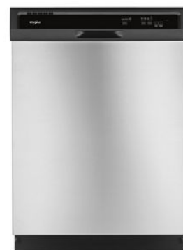
SUITE MATCH DISHWASHER WDF330PAH