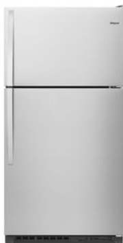
ALSO AVAILABLE / STEP UP WRT311FZD

Be sure to tune into your customers' shopping priorities to bundle products across categories