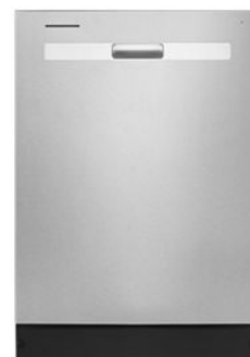
SUITE MATCH DISHWASHER WDP540HAM