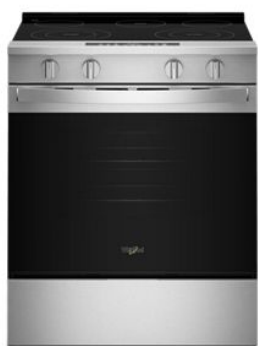
ALSO AVAILABLE / STEP UP WSES4530T

Be sure to tune into your customers' shopping priorities to bundle products across categories