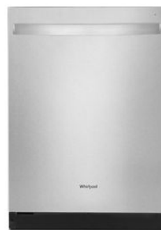
SUITE MATCH DISHWASHER WDT730HAM