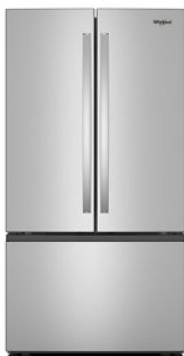
SUITE MATCH REFRIGERATOR WRFF3336S