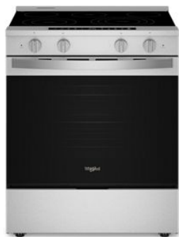
ALSO AVAILABLE / STEP UP WSES7530R

Be sure to tune into your customers' shopping priorities to bundle products across categories