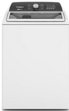
ALSO AVAILABLE / STEP UP WTW5057L

Be sure to tune into your customers' shopping priorities to bundle products across categories