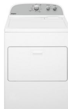
LAUNDRY / PAIR WITH WED4950H