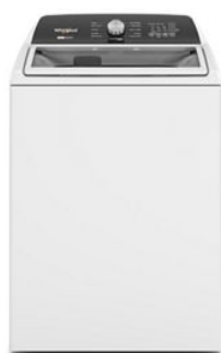
ALSO AVAILABLE / STEP UP WTW5057L

Be sure to tune into your customers' shopping priorities to bundle products across categories