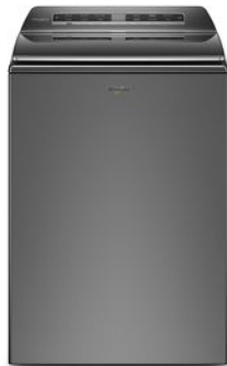
ALSO AVAILABLE / STEP UP WTW8127L

Be sure to tune into your customers' shopping priorities to bundle products across categories