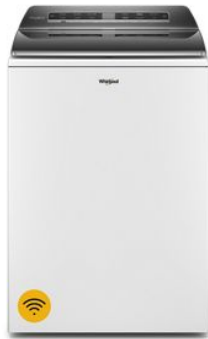
ALSO AVAILABLE / STEP UP WTW8127L

Be sure to tune into your customers' shopping priorities to bundle products across categories