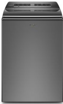
ALSO AVAILABLE / STEP UP WTW8127L

Be sure to tune into your customers' shopping priorities to bundle products across categories