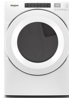
LAUNDRY / PAIR WITH WED560LH