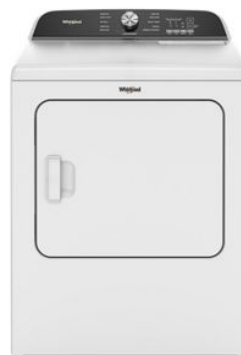
LAUNDRY / PAIR WITH WED6150P