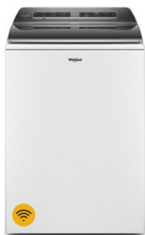
ALSO AVAILABLE / STEP UP WTW8127L

Be sure to tune into your customers' shopping priorities to bundle products across categories