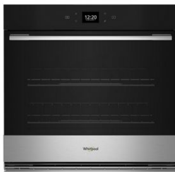
SUITE MATCH COOKING RANGE / WALL OVEN WOES5930L