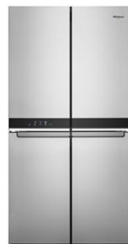
SUITE MATCH REFRIGERATOR WRQA59CNK