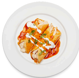
+ KEEP WARM WEE/G745H0LZ