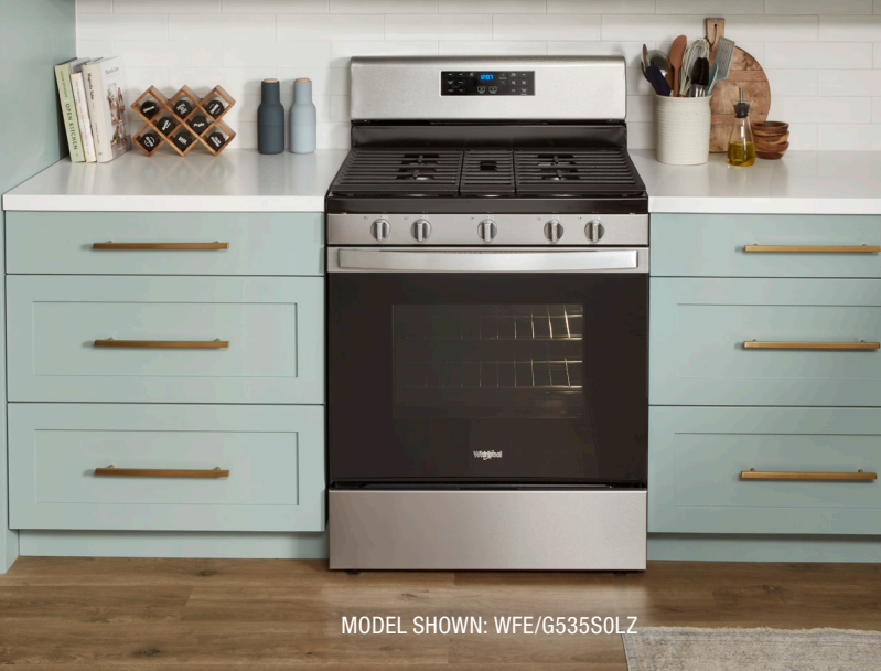
MODEL SHOWN: WFE/G535S0LZ