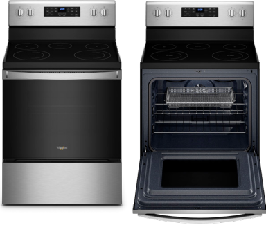
WFE535S0LZ 5.3 Cu. Ft. Capacity