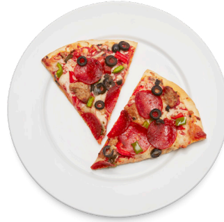
FROZEN BAKE™ TECHNOLOGY