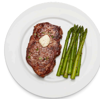
+ CONVECT BROIL WEE/G745H0LZ