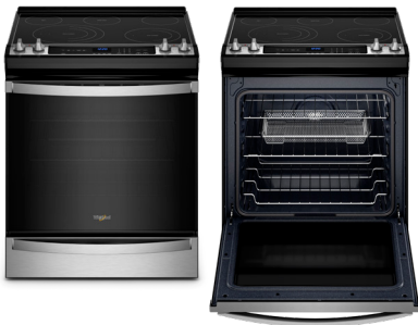
WEE745H0LZ 6.4 Cu. Ft. Capacity