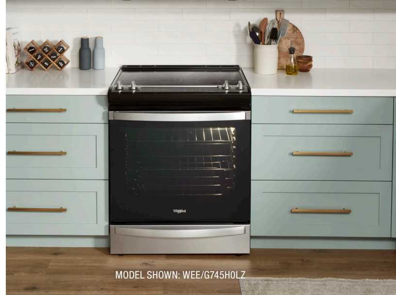
MODEL SHOWN: WEE/G745H0LZ