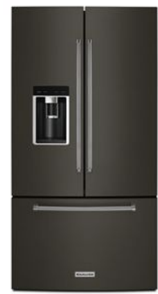
SUITE MATCH REFRIGERATOR KRFC704F