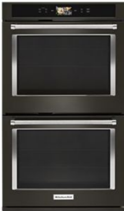
ALSO AVAILABLE / STEP UP KODE900H

Be sure to tune into your customers' shipping priorities to bundle products across categories