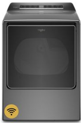
ALSO AVAILABLE / STEP UP WED8120H

Be sure to tune into your customers' shipping priorities to bundle products across categories