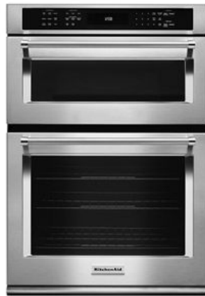
SUITE MATCH COOKING RANGE / WALL OVEN KOCE500E