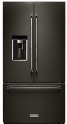
SUITE MATCH REFRIGERATOR KRFC704F