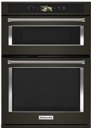
ALSO AVAILABLE / STEP UP KOCE900H

Be sure to tune into your customers' shipping priorities to bundle products across categories